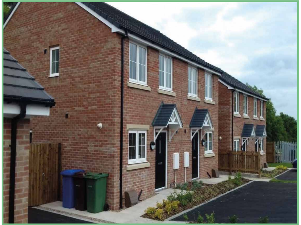
Heron Educational Foundation, Humbleton - from school to housing